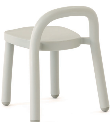
PICCOLA 2yrs: W310×D302×H298 3yrs: W315×D302×H328 4yrs: W321×D302×H358 5yrs: W327×D302×H388mm Material: PP

Soft and gentle curving outlines make seated children look charming, but the form also encourages seating in an upright posture. Details are finely tuned to avoid hurt or injury.