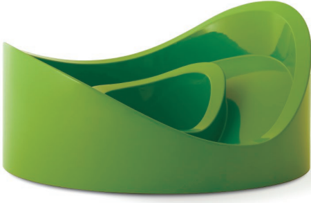
BANRI W1800×D1800×H963mm Material: FRP

Circulating pathway with continuously changing undulations and slopes. As children walk, they experience changing scenery and feel alterations in the pull of gravity. This encourages them to keep moving forward.