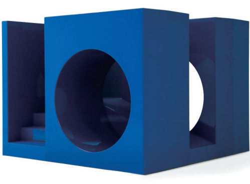
CUBE W2000×D2000×H1500mm Material: FRP

Complex of staircase, slope and tunnels created from a single cube. Children hide inside and peep out through holes provided. Multiple spatial scenes are simultaneously possible depending on how it is used.