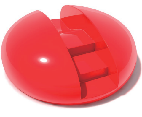
OMOCHI W2000×D2000×H700mm Material: FRP

Round and smooth form encourages children to hug and embrace it. As they do, they discover the limitless possibilities of its curvatures. Children invent interactions, leaning against the piece stroking it, or sliding along it.