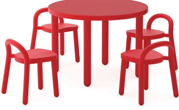
PICCOLA TABLE W700×D700×H490mm Material: PE