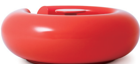
DONUT W1800×D1800×H637mm Material: FRP

Children seated on the bench turn the central handle, which rotates the equipment. Hand motions determine speed of rotation. It is like crewing a boat. Children exchange excited glances as they depart on an adventure.